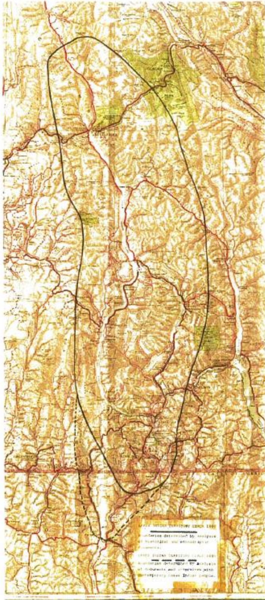
Figure 33: "Lakes Indian Territory, circa 1800 [and] circa 1880." Map includes the Slocan within traditional Lakes (Sinixt) territory. The solid-line boundary c. 1800 is based on analysis of historical and ethnographic documents; the dotted-line boundary c. 1880 is based on document analysis as well as interviews with Native consultants in the 1970s-1980s